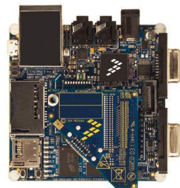
i.MX53 Quick Start board with HDMI module