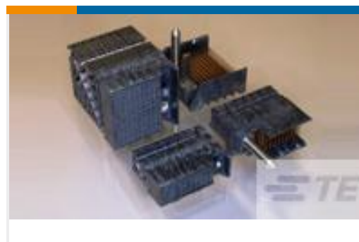
TE Part #2007804-2 IMP100S,H,V3P16C,UG,OEWS39,4.9