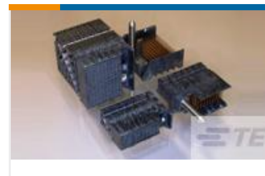
TE Part #2149976-2 IMP100S,H,V4P6C,UG,DEW39,4.9