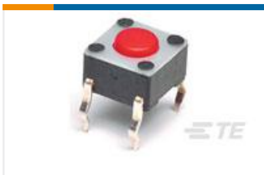
TE Part #2-1825910-7 FSM14JH=6MM TACT SWITCH, HIGH TEMP