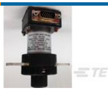
TE Part #1616068-9 K300B5C5=CONTACTOR 300 AMP SPST NO DB