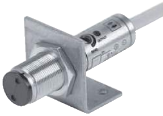
Sensor fitted inside the mounting aid

Using the mounting aid cylindrical sensors are fast and easy to fit. Use the nuts included with the sensor for attachment.