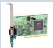
UC-324: uPCI 1xRS422/485 1MBaud