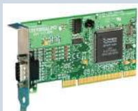
UC-320 LP uPCI 1xRS422/485 1MBaud