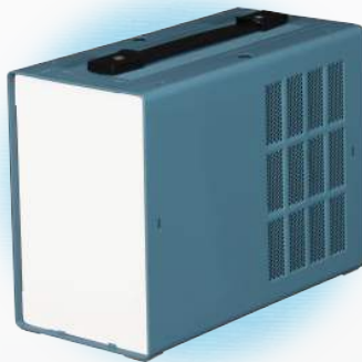
▶ Optional carrying straps