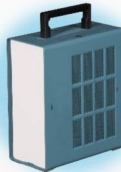
▶ Optional carrying handles