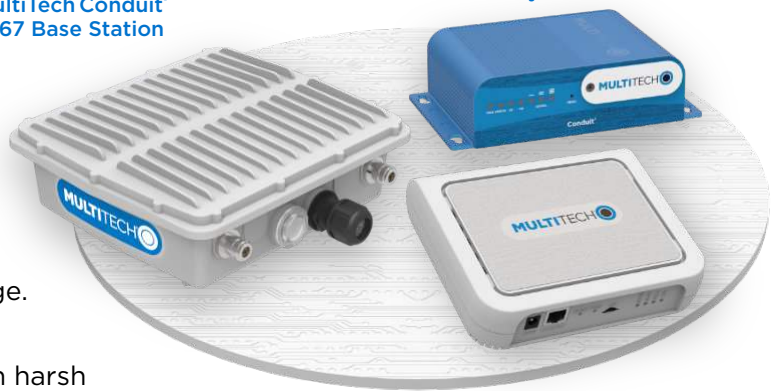
MultiTech Conduit® AP Access Point