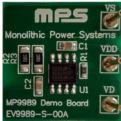
(L x W) 2.2cm x2.2cm