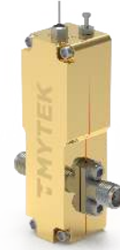
Figure 1. Connectorized Amp Photo