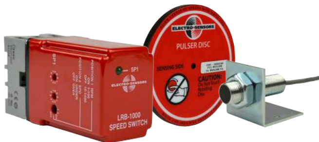
Standard System with: LRB1000 Speed Switch, 906 Speed Sensor, 255 Pulser Disc

An example of a standard LRB1000/LRB2000 system includes the LRB1000 DIN rail mount module, a 906 Hall Effect Shaft Speed Sensor, and a 255 Pulser Disc. Other shaft speed sensor and pulser target options are available.