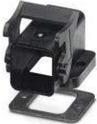
HEAVYCON D7 panel mounting base, with single locking latch, height: 25.5 mm, angled, PA, color: black

Please be informed that the data shown in this PDF Document is generated from our Online Catalog. Please find the complete data in the user's documentation. Our General Terms of Use for Downloads are valid ( http://phoenixcontact.com/download )