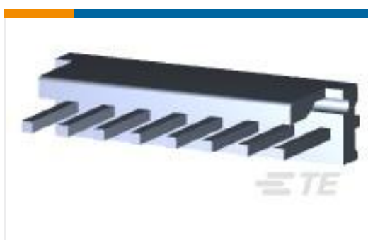
TE Part #640445-8 08P MTA156 HDR ASSY FL/STR SN