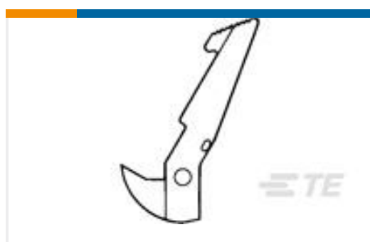
TE Part #102312-1 UNIVERSAL HEADER LATCH