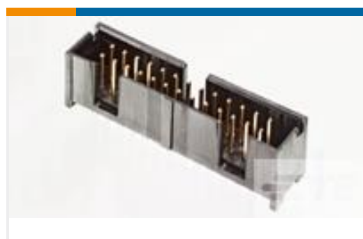
TE Part #5103309-3 A/L LOW PRO HDR 16P VERT BLACK