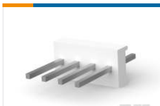
TE Part #2-640456-0 PCB Header: Polyester, Vertical, Unshrouded, No Mating Alignment