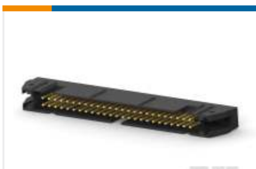
TE Part #5102153-3 AMP-LATCH UNIVERSAL HEADERS