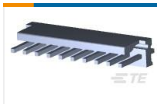
TE Part #1-640445-0 10P MTA156 HDR ASSY FL/STR SN