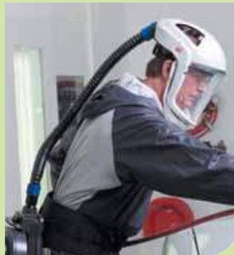
Eye and Face Protection