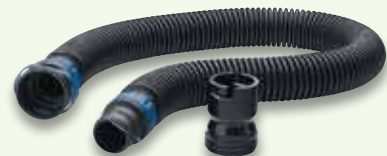
BT-40 Heavy Duty Breathing Tube