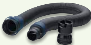
BT-30 Length Adjusting Breathing Tube