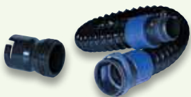
BT-20S/BT-20L Light Duty Breathing Tube

All BT-Series breathing tubes feature the QRS (Quick Release Swivel) connection for maximum comfort and ease of use.