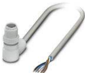
Sensor/Actuator cable, 5-position, PP-EPDM halogen-free, Gray RAL 7035, Plug angled M12, A-coded, on Free cable end, Cable length: 1.5 m, Hygienic design, with plastic knurl

Please be informed that the data shown in this PDF Document is generated from our Online Catalog. Please find the complete data in the user's documentation. Our General Terms of Use for Downloads are valid ( http://download.phoenixcontact.com )