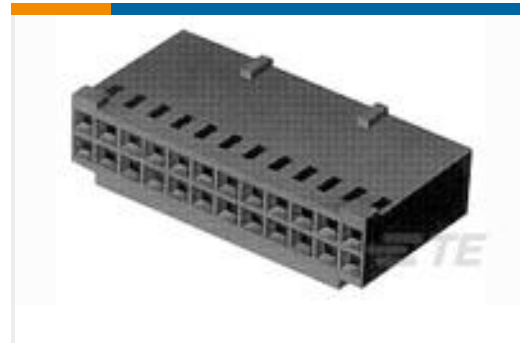
TE Part #3-87977-5 20 MODIV HSG COMP DR .100 POL