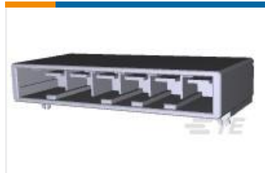
TE Part #1-179959-2 DYNAMIC D-5200 HDR ASSY 6P H X