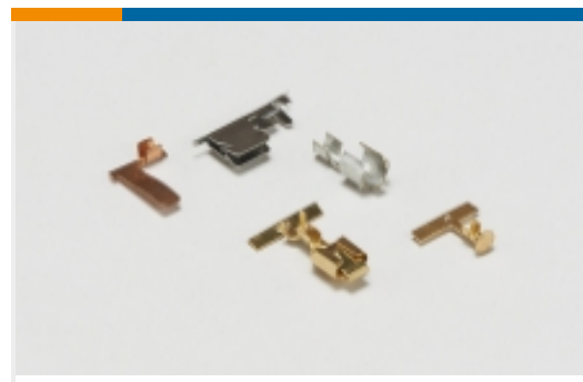
Special Purpose Terminals(1)