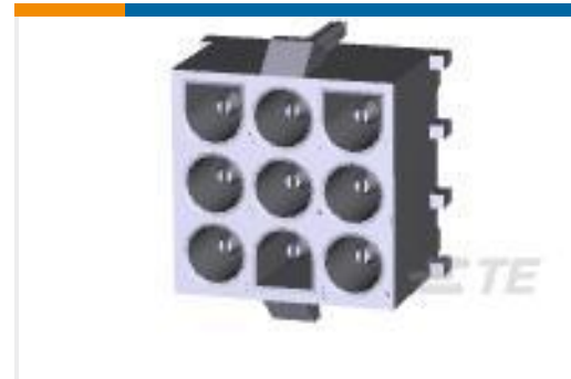
TE Part #1-641972-1 09P UMNL PIN HDR ASSY BLACK