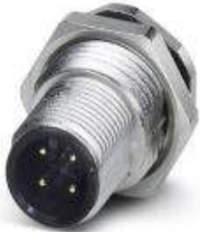
Flush-type connector, 4-position, Flush-type plug, straightLink:M12, A-coded, Solder pins

Please be informed that the data shown in this PDF Document is generated from our Online Catalog. Please find the complete data in the user's documentation. Our General Terms of Use for Downloads are valid ( http://download.phoenixcontact.com )