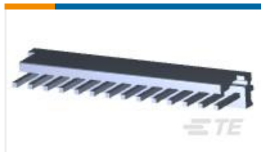
TE Part #1-640445-4 14P MTA156 HDR ASSY FL/STR SN