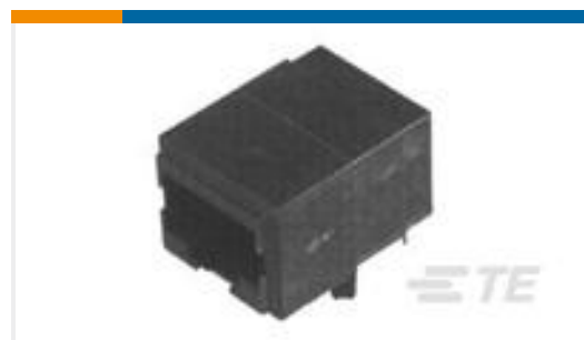
TE Part #5558065-1 MJ ASSY,10POS,R/A,LPF