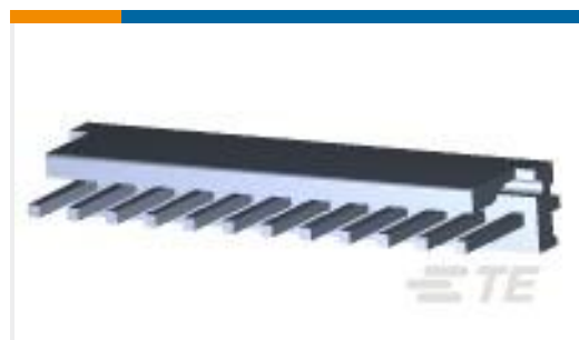
TE Part #1-640445-2 12P MTA156 HDR ASSY FL/STR SN