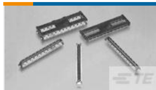
TE Part #3-1827253-6 .5FHP05H,220,S,GIG,08/Sn,HT,NSYes