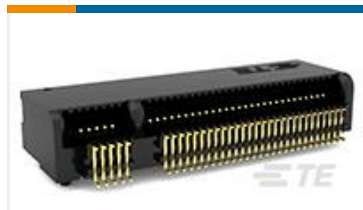
TE Part #1-2199230-5 M.2 0.5PITCH 4.2H KEY M 15U" AU