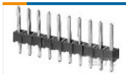
TE Part #5-146280-3 03 MODII HDR SRST B/A .100CL