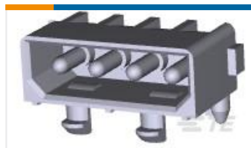
TE Part #641737-1 04P CMNL HDR ASSY R/A PC NATL