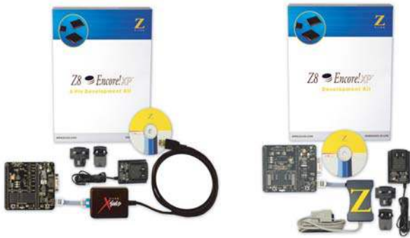
20, 28-Pin Development Kit