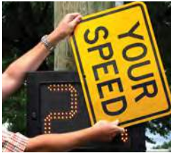
Folding Sign Plate

Battery Power: Lithium ion batteries offers extended operation with choice of 9.6V, 10Ah battery for two week performance or 12.8V, 15Ah battery for four week performance before recharge under normal operating conditions.