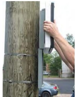
Universal mounting bracket

Folding Sign Plate: Sign is available with smaller "Your Speed" sign plate that folds compactly for convenient relocation.