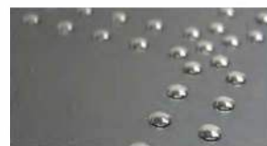
Individual Protective Lenses Close-up View of Sign Digit