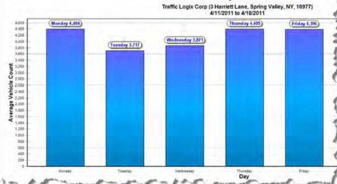
Average Vehicle Count