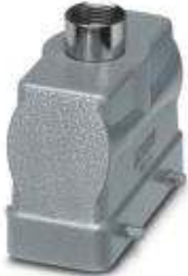
HEAVYCON B16 sleeve housing, for double locking latch, height: 76 mm, with 1 x Pg29 gland, straight cable outlet

Please be informed that the data shown in this PDF Document is generated from our Online Catalog. Please find the complete data in the user's documentation. Our General Terms of Use for Downloads are valid ( http://download.phoenixcontact.com )