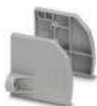
Flange cover, Color: gray