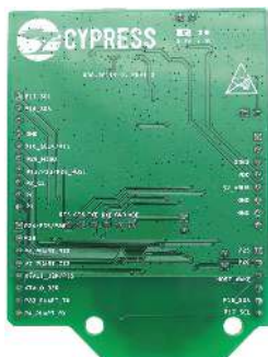
Figure 2: CYBT-413034-EVAL Bottom View

SW1: Reset Switch routed to the XRES connection on the module.