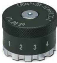
Locator for CRIMPFOX-TC MP6

https://www.phoenixcontact.com/us/products/1142829