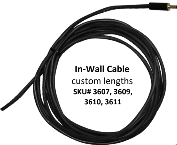
In-Wall Cable custom lengths SKU# 3607, 3609, 3610, 3611

Inspired LED's unique line of Interconnect Accessories are compatible with 3.5mm x 1.3mm DC input/output jacks. Cables are available in standard or custom lengths, and all interconnect products combine easily with Inspired LED flex strips and LED panels to create the perfect low-voltage lighting system for any location.