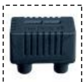
Capacitance Ext Module