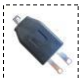
5V, 1KHz Output