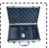
Metal Case (optional)