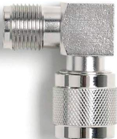
Model 73053 TNC Right-Angle Jack to Plug Adapter