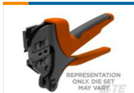
TE Part #2390077-1 SDE F MQS PIN/SKT 0.75-0.50mm2 ASSY