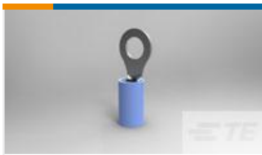
TE Part #8-320574-1 TERMINAL,PIDG R 16-14 10