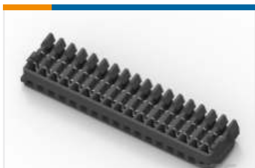
TE Part #3-353293-7 1.5MM CT MT REC ASSY 17P BLACK