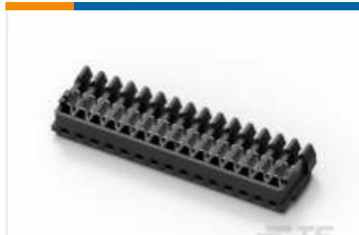
TE Part #3-353293-5 1.5MM CT MT REC ASSY 15P BLACK