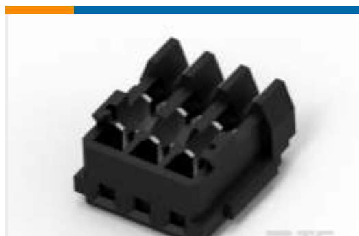
TE Part #2-353293-3 1.5MM CT MT REC ASS'Y 3P BLACK