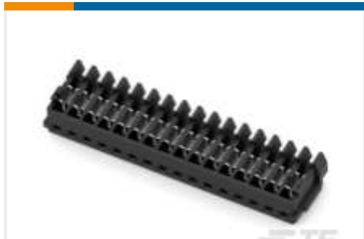
TE Part #3-353293-6 1.5MM CT MT REC ASSY 16P BLACK