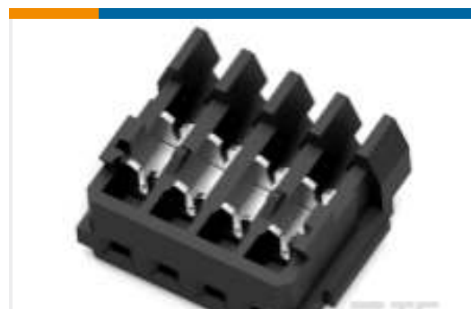
TE Part #2-353293-4 1.5MM CT MT REC ASS'Y 4P BLACK