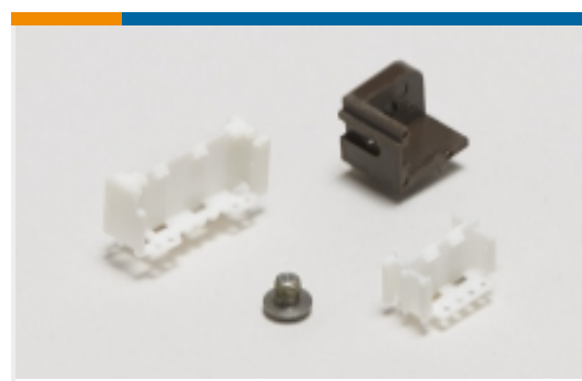
PCB Connector Mounting(10)