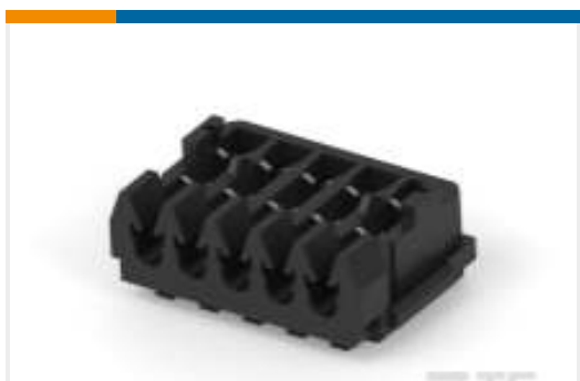
TE Part #2-353293-5 1.5MM CT MT REC ASS'Y 5P BLACK