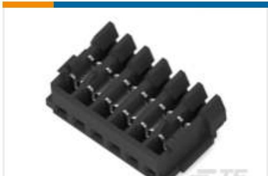
TE Part #2-353293-6 1.5MM CT MT REC ASS'Y 6P BLACK