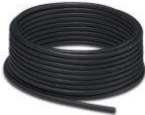
Cable ring, PUR halogen-free black, 4-pos., conductor colors: brown / white / blue / black, cable length: 100 m

Please be informed that the data shown in this PDF Document is generated from our Online Catalog. Please find the complete data in the user's documentation. Our General Terms of Use for Downloads are valid ( http://phoenixcontact.com/download )