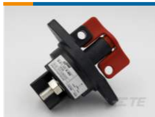
TE Part #K1166104 Battery Disconnecter 35-414-131-S-900