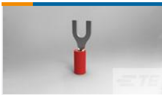
TE Part #32051 PIDG SPD 22-16COMM 22-18MIL 10