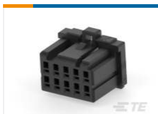
TE Part #1-1827864-3 Receptacle and Tab Housing: 2.5 mm Pitch, 250V