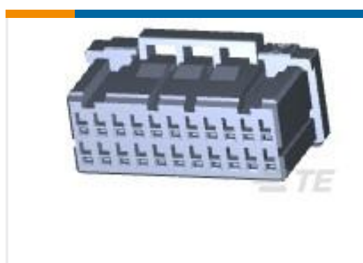
TE Part #1-1827863-1 DYNAMIC 1100D REC HSG 22P X BLACK