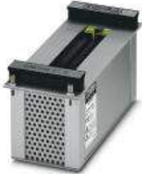
Test adapter for COMTRAB CT 10

Please be informed that the data shown in this PDF Document is generated from our Online Catalog. Please find the complete data in the user's documentation. Our General Terms of Use for Downloads are valid ( http://download.phoenixcontact.com )