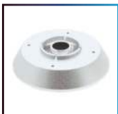
Diffuser Attachment for Mighty Scope v2 #26700-218-DIFF