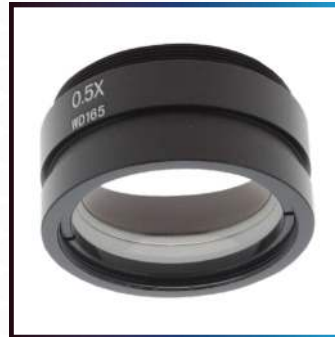
0.5X Auxiliary Lens