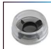
Polarizer Attachment for Mighty Scope v2 #26700-219