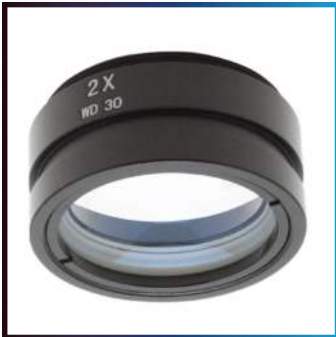
2X Auxiliary Lens