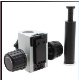
Focus Mount Arbor