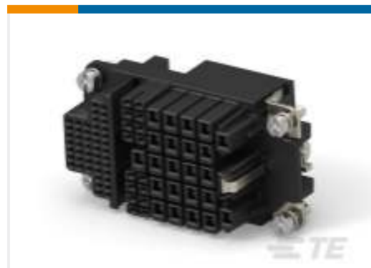
TE Part #T2120865201-000 HK-HDW3/1/1-23/16/47-F