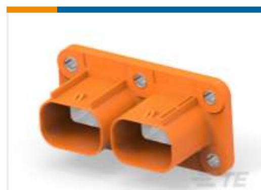
TE Part #1-2103346-2 HVA280 2 Bay Header Sub-Assy, KEY D, F