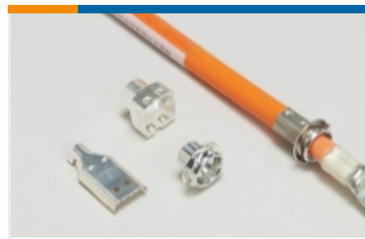
Automotive Connector EMC Shielding (15)