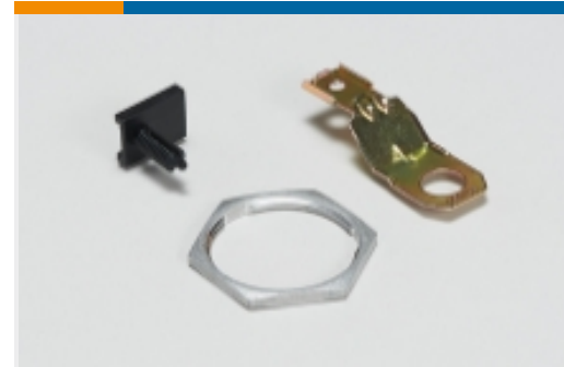
Other Automotive Connector Accessories(37)