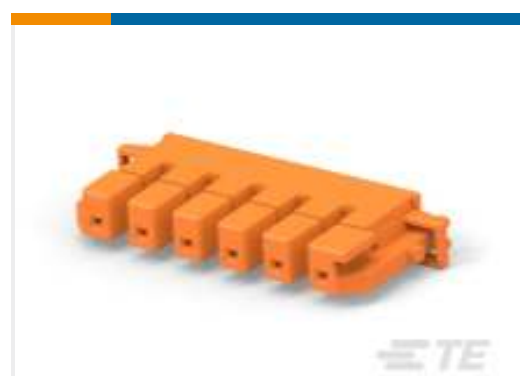
TE Part #2322948-2 6POS,MQS,REC HSG,UNSLD