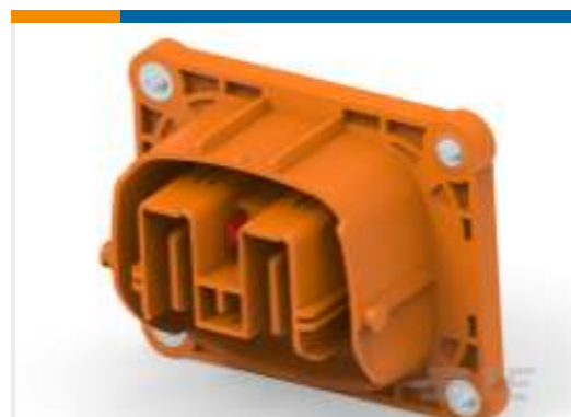
TE Part #2340465-1 2POS,PCON21,HDR OUTER HSG ASSY,COD A