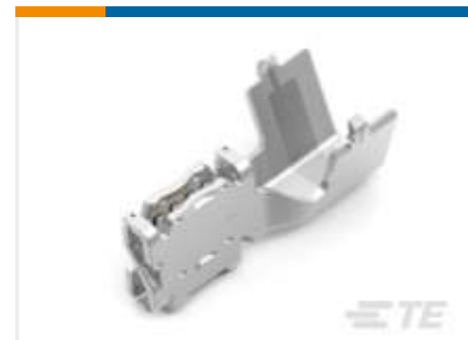
TE Part #2317017-2 PCON 21,TERMINAL,UNSLD,CB, 90DEG