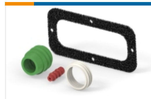
Connector Seals & Cavity Plugs(8)