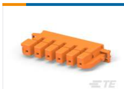
TE Part #2322948-1 6POS,MQS,REC HSG,UNSLD