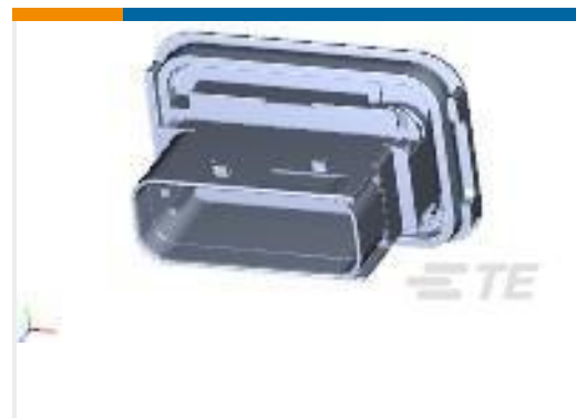
TE Part #1-1564526-1 18POS,TAB 1.6X0.6,TAB HSG,ASSY