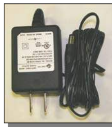
5V-2A Power Supply