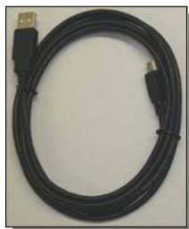
USB Cable (6ft/2m)