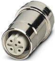
Sensor/actuator flush-type socket, 5-pos., M12, B-coded, front/press-in mounting, with straight solder connection

Please be informed that the data shown in this PDF Document is generated from our Online Catalog. Please find the complete data in the user's documentation. Our General Terms of Use for Downloads are valid ( http://download.phoenixcontact.com )