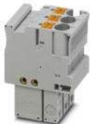
Plug, 3-pos. with integrated, automatic short circuit function

Please be informed that the data shown in this PDF Document is generated from our Online Catalog. Please find the complete data in the user's documentation. Our General Terms of Use for Downloads are valid ( http://download.phoenixcontact.com )