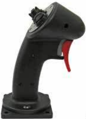
Index trigger with trigger guard