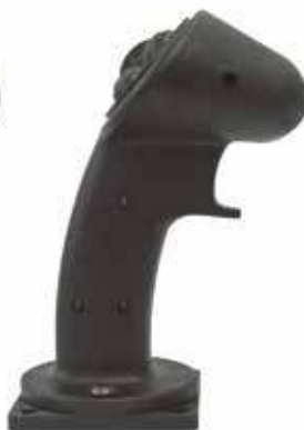
No index trigger