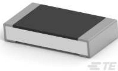
TE Part #5-2176390-1 RQ 1206 3K83 0.1% 10PPM 5K RL