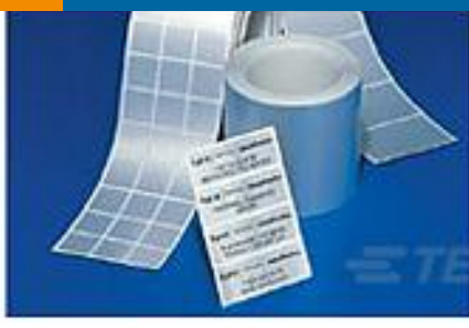
TE Part #E88375-000 HM-191064-10-8A