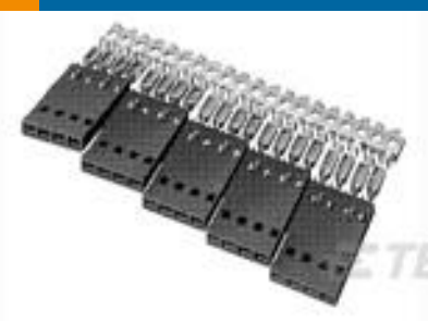
TE Part #5-104439-6 2X7 MTE RCPT SR PLAIN .100CL