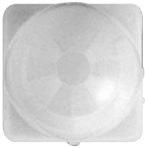
• FRONT SIDE