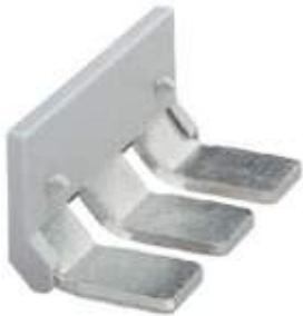
Insertion bridge, Number of positions: 3, Color: gray

Please be informed that the data shown in this PDF Document is generated from our Online Catalog. Please find the complete data in the user's documentation. Our General Terms of Use for Downloads are valid ( http://phoenixcontact.com/download )