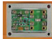
3. Install into Housing