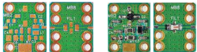
1. Select Circuit Board