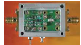
4. Add Connectors and Bias