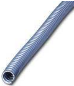
Protective hose, spring steel wire with PU coating, highly stranded

Please be informed that the data shown in this PDF Document is generated from our Online Catalog. Please find the complete data in the user's documentation. Our General Terms of Use for Downloads are valid ( http://phoenixcontact.com/download )