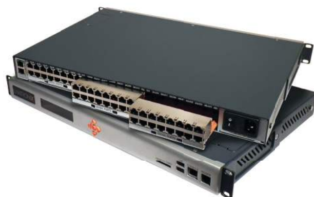
Model shown: 48-Port Single AC Supply (Part Number: SLC804812015)

The Lantronix® SLC™ 8000 advanced console manager is the industry's first modular console server that provides secure remote access to IT equipment while reducing deployment costs and time.