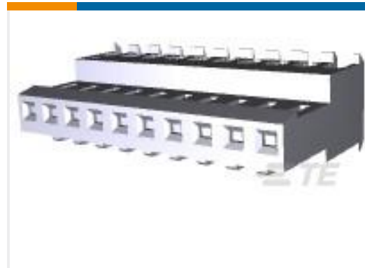
TE Part #4-640621-0 10P MTA100 CONN ASSY F/T NATL