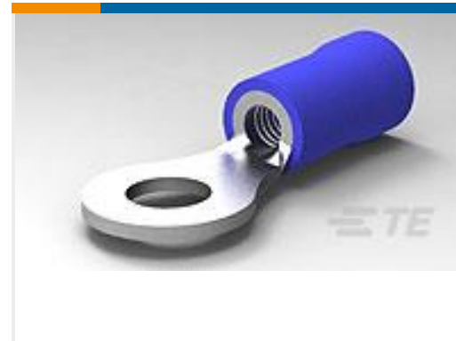
TE Part #34160 TERMINAL,PG R 16-14 8