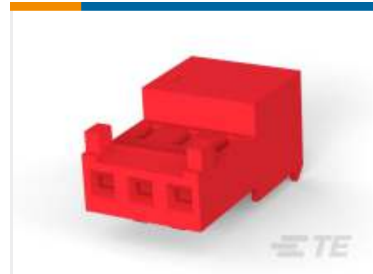
TE Part #4-644563-0 Nylon Tin Plated Receptacle: 2.54 mm, with Mating Alignment, MTA 100