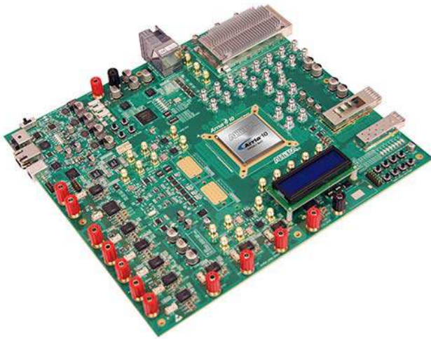
Figure 1. Arria 10 GX Transceiver Signal Integrity Development Kit

Altera's Transceiver Signal Integrity Development Kit, Arria® 10 GX Edition helps you thoroughly evaluate the signal integrity of Arria 10 GX transceivers. This development kit delivers a complete design environment that includes all hardware and software you need to start taking advantage of the performance and capabilities available in Arria 10 GX FPGAs.