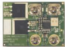
OR-ing Board Option

Typical Mechanical Drawing: Inches (millimeters), connectors and pinouts may vary with model. Refer to XL375 Product Specification for complete information.