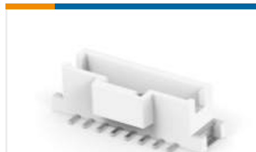
TE Part #1-2232829-8 SGI2.0 HEADER ASSEMBLY SMT 8P, KEY A,NTL