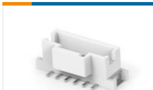
TE Part #1-2232829-6 SGI2.0 HEADER ASSEMBLY SMT 6P, KEY A,NTL