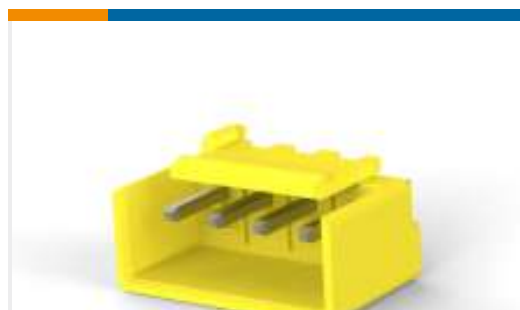
TE Part #1744484-4 04P EP SHRD HDR ASMY, YELLOW