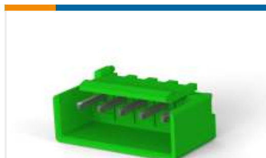
TE Part #1744485-5 05P EP SHRD HDR ASMY, GREEN