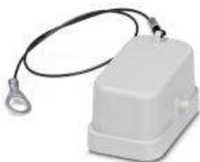
Protective cover for HC-COM-K... housing for male contact inserts

Please be informed that the data shown in this PDF Document is generated from our Online Catalog. Please find the complete data in the user's documentation. Our General Terms of Use for Downloads are valid ( http://download.phoenixcontact.com )