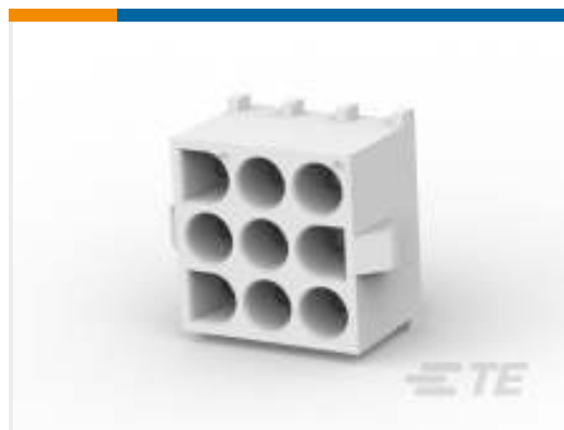
TE Part # 350990-4 09P UMNL HDR ASSY LNG/TL