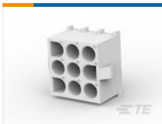
TE Part # 641972-1 09P UMNL PIN HDR ASSY 94VO