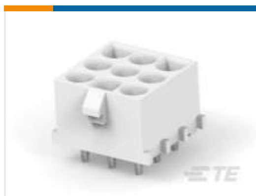
TE Part # 1969818-1 09P UMNL PIN HDR ASSY NATL, PIN V0 GW