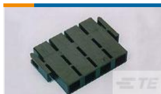
TE Part #556879-6 PLUG HSG,AMPINNRGY WTB,6 POS