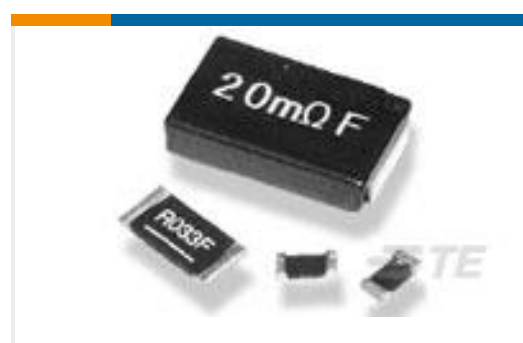
TE Part #2-1879378-4 TLR 2512 3.0W R002 1% 50PPM 2K RL