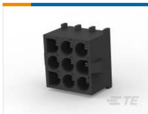
TE Part # 1-641972-1 09P UMNL PIN HDR ASSY BLACK