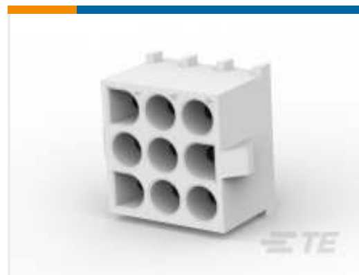
TE Part # 350763-4 09P UMNL HDR ASSY PC