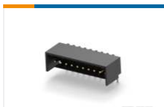
TE Part #2-644488-6 PCB Header, Right Angle, Polyester, 2.54 mm