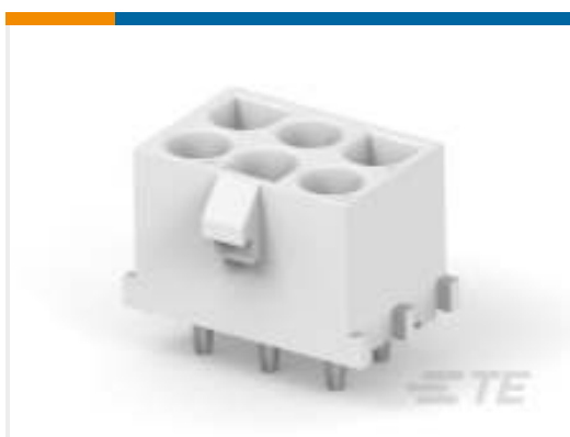
TE Part # 1969811-1 06P UMNL SKT HDR ASSY, SCKT V0 GW