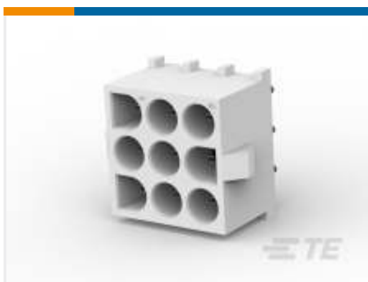
TE Part # 350742-1 09P UMNL PIN HDR ASSY 94VO