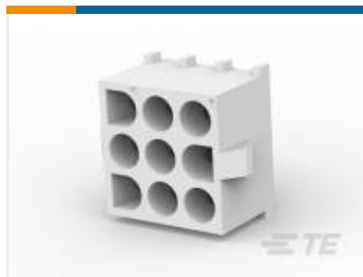
TE Part # 350828-1 09P UMNL HDR ASSY PC 94VO