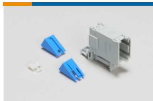
Rectangular Connector Adapters(7)