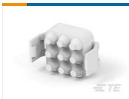
TE Part # 643254-1 09P UMNL ASSY MOD HSG V0