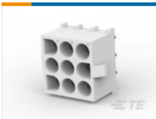
TE Part # 350835-1 09P UMNL HDR ASSY PC 94VO