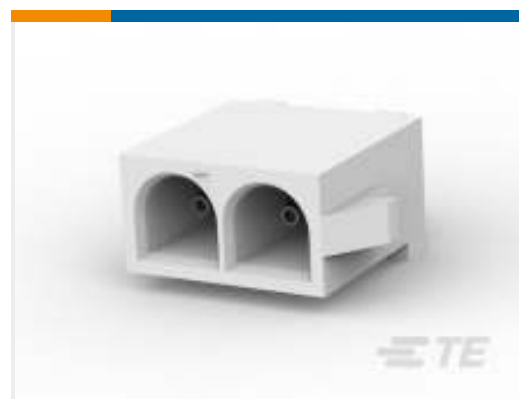
TE Part # 1586879-1 09P UMNL SKT HDR ASSY, GW