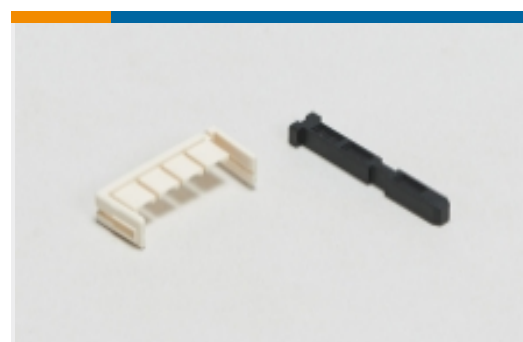
Rectangular Connector Keying Plugs(3)