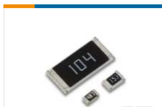
TE Part #2-2176343-4 CRGCQ 1206 820R 1%