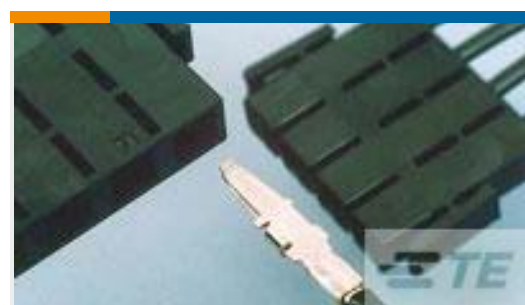
TE Part #556880-1 CONT,AMPINNRGY WTB,LS PC,10-12