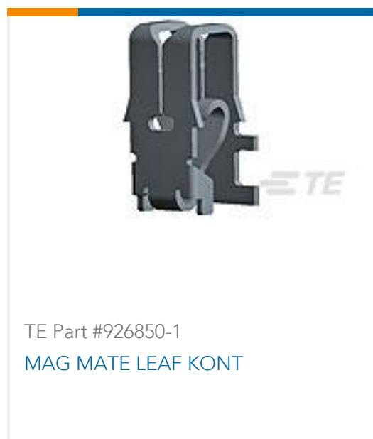
TE Part #926850-1 MAG MATE LEAF KONT